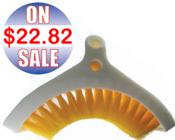
#1459 Gutter & Exhaust Stack Brush