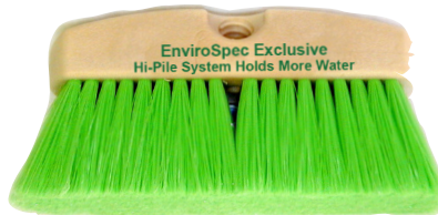
#1452 18" Truck Wash