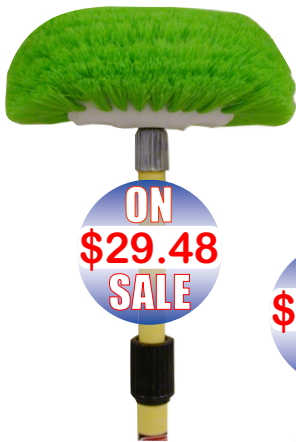
#1458 Bi-Directional Brush - 1/2 Circle